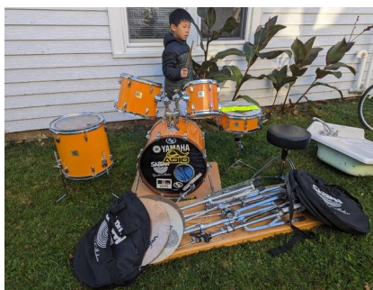
We now have a drum set in our sanctuary. We are looking to start a church band!