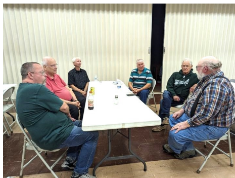
October UMM meeting with the Gideon International