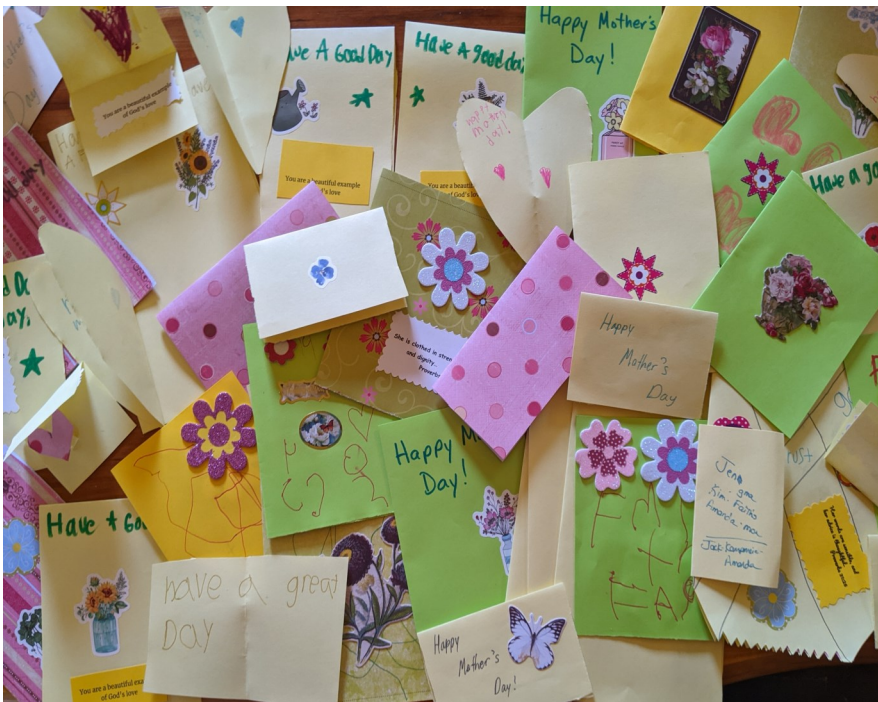
Mother's Day Cards