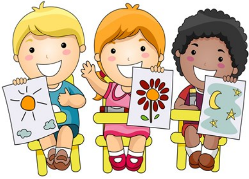
Mother's Day Cards