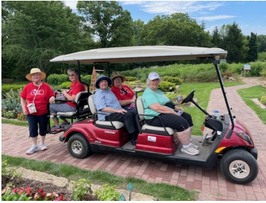
Soul Sisters June Outing to the Dubuque Arboretum