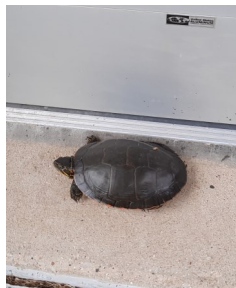
This little guy was waiting at the door to the church on the morning of Thursday, June 20th. All God's creatures know where to come!