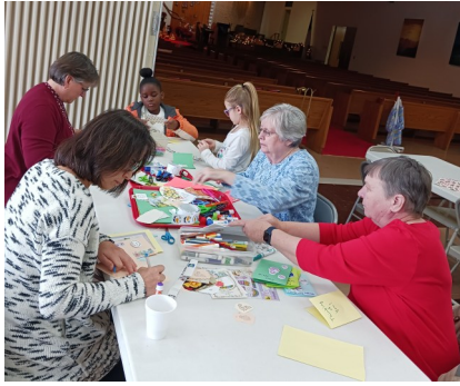
Kids Kards - Everyone was hard at work!