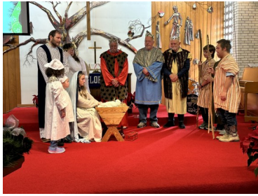
Hanging of the Greens Service