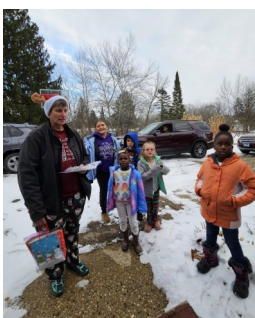
Sunday School Kids decorated cookies then went caroling and passing out the cookies they made.