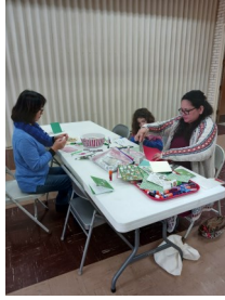
Kids Kards - Everyone was hard at work!