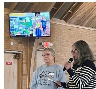
Keagy Town & Rural Festival, Dixon, IL