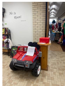
Holiday Harvest Vendor Show was a huge success! Our net profit was $1560.00!