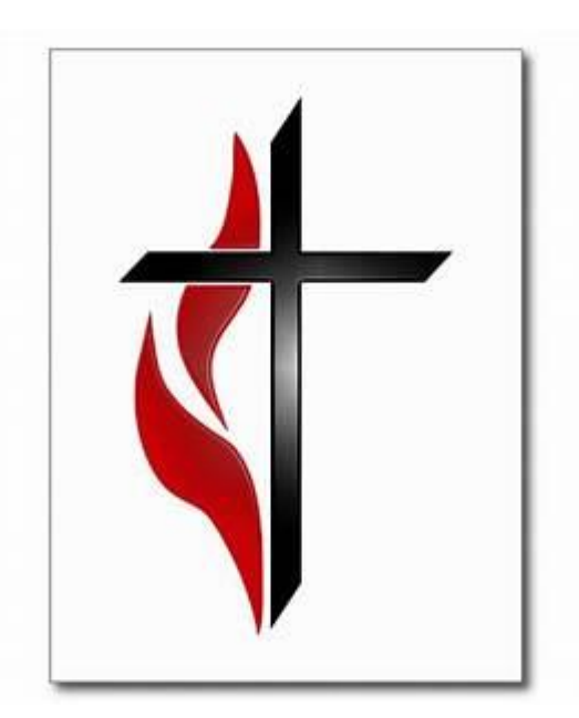
First United Methodist Church Sunday, 10:15 am March 10<sup>th</sup>, 2024

New Sewing Ministry — We invite all sewers to get involved in our sewing ministry buy getting a kit in the sewing room. Several are available. (Pattern & material) Check out this ministry in the sewing room after church or ask any member of United Women in Faith. This gives those who cannot come Monday afternoons to sew a chance to be part of this important ministry by sewing at home at your convenience. Check this out!!!